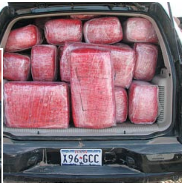
BUSTED (Left) Alfredo Beltrán Leyva, a top deputy in the Sinaloa cartel, during his arrest in January. (Above) Marijuana seized near the border in Hudspeth County, Texas, in January 2006.