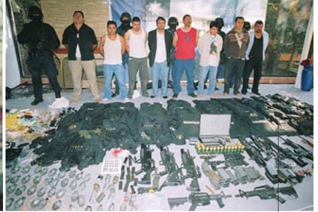
DRUGS, GUNS, AND DEATH (Clockwise from top left) The bullet-pocked windshield of a Nuevo Laredo deputy thought to have been killed by drug dealers; alleged cartel members who were captured, along with a huge cache of high-powered weapons, during a raid in Mexico City in January; Gulf cartel leader Osiel Cárdenas Guillén during his extradition to the U.S. in January 2007.

law-enforcement officials I spoke with. Until recently, members of the Sinaloa cartel had managed to avoid the government crackdown that was devastating the rival Gulf cartel. But Mexican president Felipe Calderón now seemed to be going after the Sinaloans too, and word had come from informants that Guzmán, who's infamous for killing politicians when he's not buying them off, had given orders to bring the war to the capital. Beltrán Leyva, it seems, "was tasked with taking some reprisal action or took it upon himself to go out and make a hit," an A.T.F. agent who frequently works in Mexico tells me.